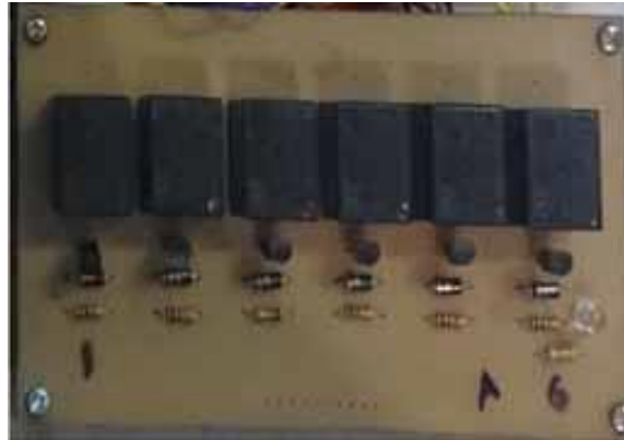
Figure 2. Relay module

relay as an electronic switch will be developed to trigger a voltage current to enter numerical data on a digital kWh-meter as a substitute for a digital kWh-meter keypad. Based on Figure 2 is a picture of the relay module used in this study.