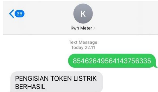
Figure 7. Display of topping up the digital kWh-meter electricity tokens

Based on the results of the trials we have carried out, the system we have built successfully topped up the electricity token vouchers with a success accuracy of up to 98%. We obtained those results based on the calculation of the total voucher codes that have been successfully entered into electricity tokens, which are 49 trials divided by the total code vouchers that have been successfully sent are 50 trials, then multiplied by 100%. Furthermore, Figure 7 below is a display of information on sending the voucher code and the results of the information if the relay has successfully topped up the digital kWh-meter electricity token.