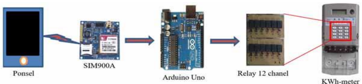
Figure 1. System architecture design

The design of the digital kWh-meter pulse top up prototype is built from three core parts, including input, process, and output. The input of this system is a 20-digit voucher code in SMS format, which is sent from the mobile phone to the SIM900A GSM module, after which Arduino Uno will process the SMS data received by the GSM module to control the 12-channel relay module, which functions as output. The relay in this study is used to replace the existing keypad function on the digital kWh meter. Therefore, the format of the SMS voucher code sent from a mobile phone can be entered into the digital kWh-meter based on the input from the relay trigger, which Arduino Uno controls. Figure 1 is the architectural design built in this study.