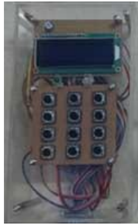
Figure 3. Digital kWh-meter prototype