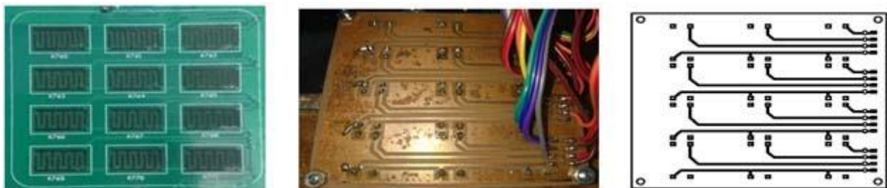
Figure 6. Left: Original digital kWh-meter keypad assembly; Centre: Keypad kWh-meter prototype circuit; Right: Digital kWh-meter keypad data path

The power supply in this study is a resource used to provide electric current to each component, which are 5 Volts DC and 12 Volts DC. The function of the SIM900A GSM module is as a device that is used to receive electricity token pulse data in the form of SMS sent from a cell phone and then sends the data to Arduino Uno for processing. In this study, the function of the Arduino Uno is as a data processing centre, where the Arduino Uno will process the SMS data received by the SIM900A GSM module. Then, it instructs the relay to turn on and off to enter the electricity token number data into the digital kWh meter. Furthermore, the relay function in this study is a device used to enter data in the form of numbers into a digital kWh-meter which acts as a substitute for a digital kWh-meter keypad input. In a digital kWh meter, when the keypad is pressed, it will trigger the data path on the keypad circuit to enter numeric data into the microcontroller system. Therefore, in this study, the keypad function was replaced with a relay as a trigger to enter numerical data into the digital kWh-meter microcontroller. Figure 6 is a series of keypads on a digital kWh-meter with a built prototype tool.