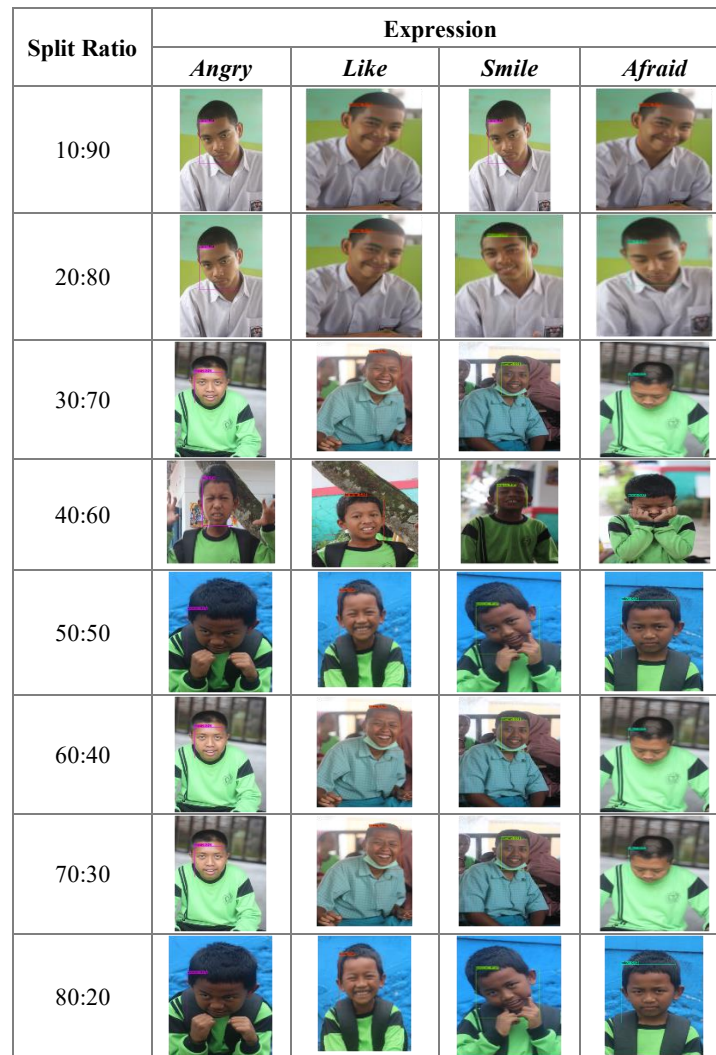
Table 1. Comparison of detection results for each split ratio

The choice of these preprocessing techniques is driven by the need to increase the variability within the dataset, ensuring that the model can handle different lighting conditions, orientations, and subtle facial expression variations. Resizing and normalization ensure uniformity, which is critical for maintaining model performance across diverse input conditions.