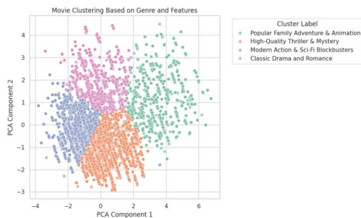
Figure 2. Visualization of Movie Clustering Based on Genre and Additional Features

Table 8 reports the internal clustering validation scores for each K value. The configuration with K = 4 emerged as optimal, balancing compactness and separation most effectively.